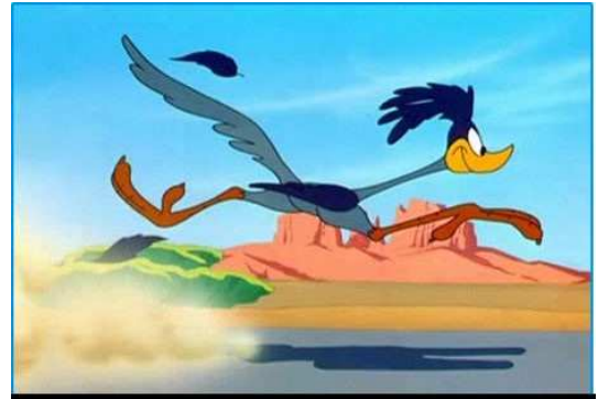
North Carolina Senators On The Move!